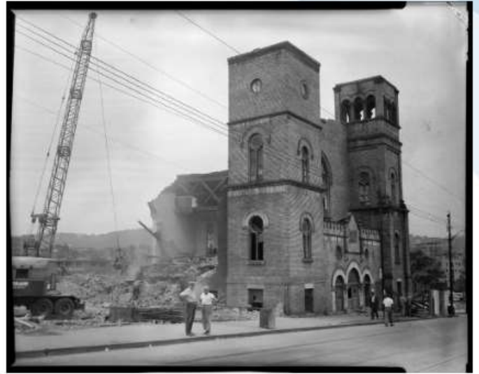
"Demolition of Bethel AME Church, Wylie Avenue and Elm Street, Lower Hill District, Pittsburgh, Pennsylvania, July 24, 1957."

Our synod has walked alongside Bethel AME Church in recent years as they fought for restorative justice since being displaced in the 1950's. But the journey is not finished, it is just beginning, and our synod has been asked to help.